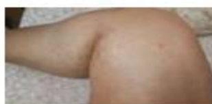
PUPPS ON THIGH AND LEGS