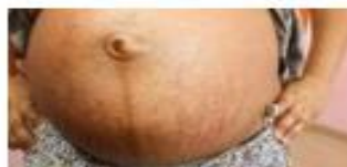
PUPPS ON WHOLE ABDOMEN