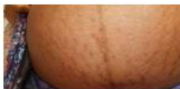
PUPPS AROUND STRECH MARKS ON ABDOMEN