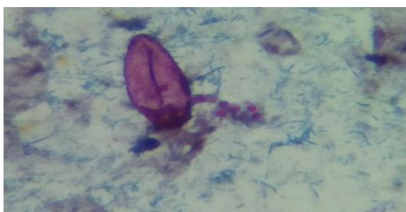
Figure 2: Isospora belli and Cryptosporidium parvum cyst in modified Z-N Staining