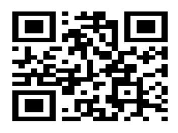
QR Code for Mobile Users

Key words: Dry powder inhaler, micromeritics, static charge