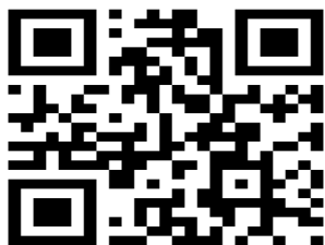
QR Code for Mobile Users

(Received 10 February 2022; Accepted 25 February 2022; Published 4 March 2022) ISSN: 2347-8136 ©2022 JMPI